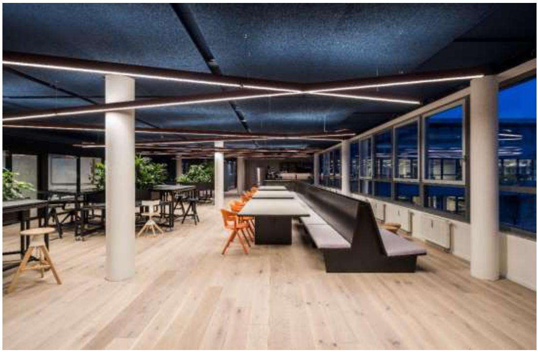
The marketplace is the core of the office: the entire space is based on the structures of a small town, providing parallel opportunities for collaboration, communication and concentrated work, and for recreation and refreshment.

Munich, Germany, March 25, 2022. Work-life balance, remote work and more flexible corporate structures: the line between work and leisure is becoming more and more blurred in everyday life. Companies must adapt to this trend and create a working environment that promotes both productivity and a community spirit. Drees & Sommer SE shows us how this works. The Stuttgart-based planning and consulting company specializes in construction and real estate. At its Munich location, the company has now used the very latest techniques to put its expertise in the design of working environments into practice. The mission was clear: to design an office environment based on individual needs that encourages both creativity and togetherness. The concept has now been recognized with the international Best Workspaces award for architecture.